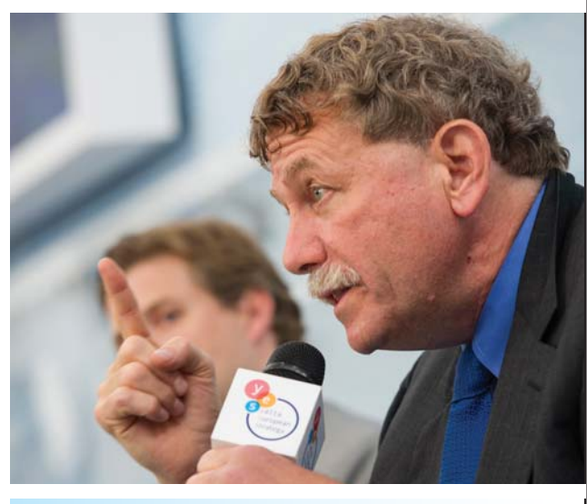
"The sorts of things that innovation does have impacts on timescales like ten years, but huge impacts."