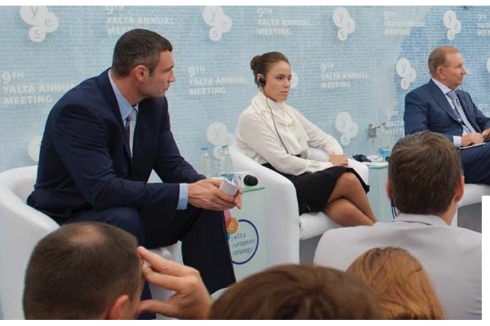
"You should have the united idea that will be supported by all political parties that will keep your country on a single path." Chrystia Freeland