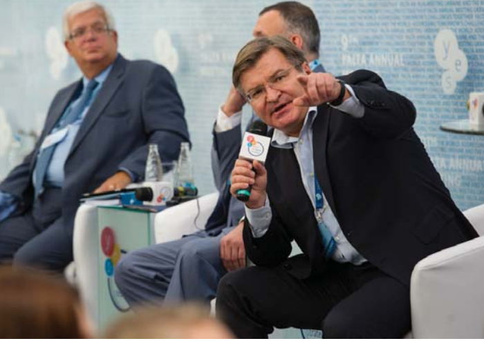
"We, European friends of Ukraine, will not give up seeking a democratic and prosperous Ukraine."