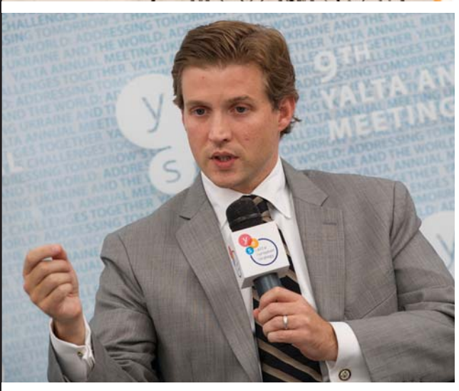
"The government's role in innovation and entrepreneurship should principally be to unleash it."